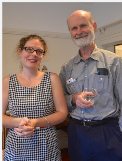
2015 Student Welcome Lunch in the Posters for Peace Gallery