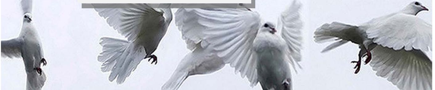
Birthday celebrations in the Posters for Peace Gallery