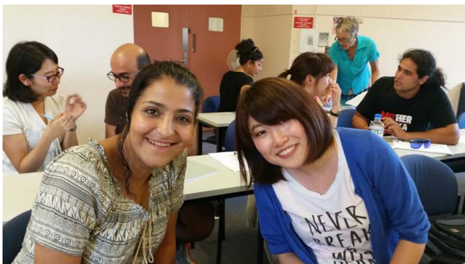
A student from the Refugee Language Program with a Japanese student from Chuo University

In 2014 we piloted a tutoring scheme with Sydney University Law Students: the SULLS Refugee Language Tutoring Program, which is continuing this year. I will train a group of students who will then meet a refugee once a week for a two hour language session. When the group advertised within their Faculty for volunteers, over 100 students applied. It is very heartening to see that these young students recognise the terrible conditions facing refugees in Australia and want to help in some way. On 5 May I also trained another group of volunteers, who will be working with refugees on an individual basis. Some refugees have so little money they cannot afford to attend classes, others