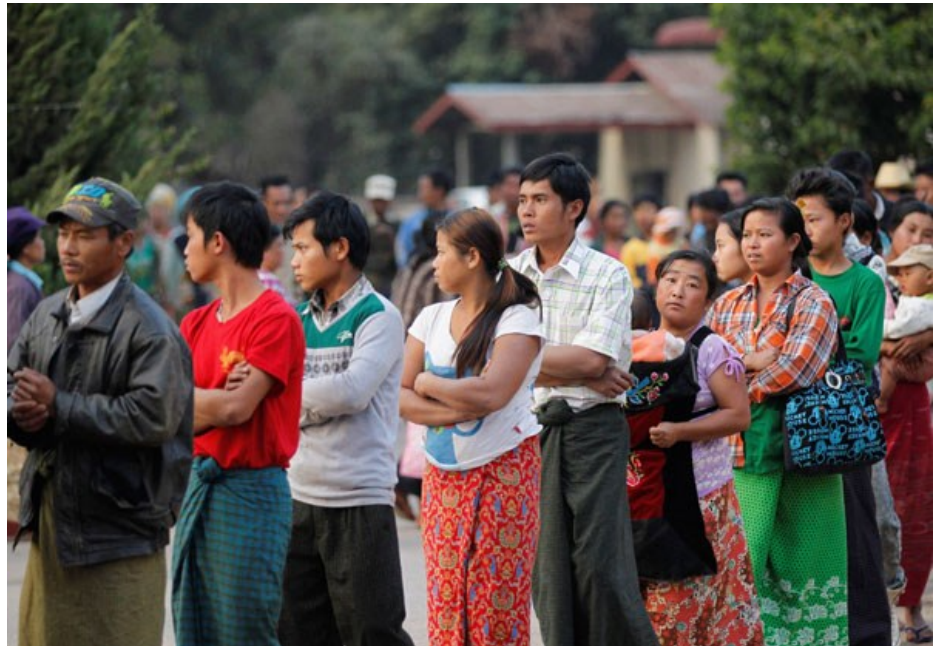
Refugees line up for food at a monastery functioning as a refugee camp in Lashio, 16 February 2015

China's capricious attitude can be seen in two cases. The first one is its acceptance of over 260,000 Indochinese refugees during Vietnam's invasion of Cambodia. The government and the UNHCR agreed to the project for assistance to Indochinese refugees in China in 1979. China then became the 2nd largest host country for Indochinese refugees in terms of number of refugees re-