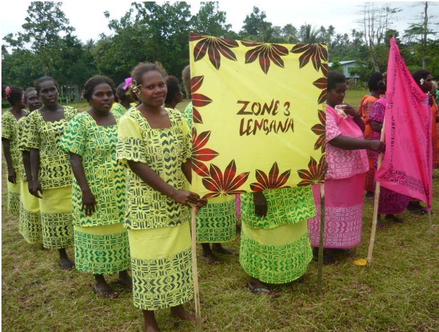
Simbo women wearing the island dress they designed, printed and hand sewed

A particularly successful and empowering example of this, was a project on the island of Simbo, where women designed their own island dress with the symbol of the frigatebird. During the launch of the project (July 2014) women from Simbo's four zones paraded around the village commons wearing their island dress, to the beat of panpipes and drums.