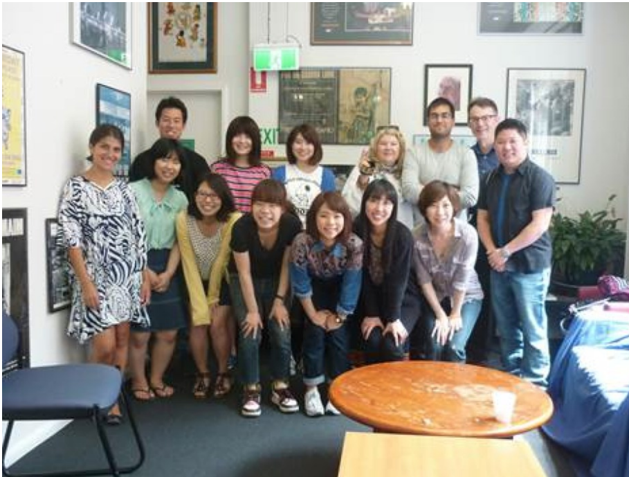
Japan-Australia program participants in the Posters for Peace Gallery at CPACS

trying to make Indigenous lore into law.