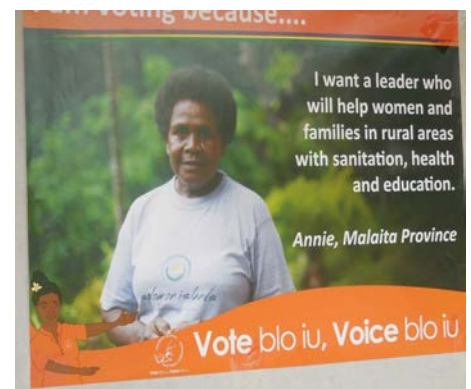
One of a series of election posters voicing women's concerns

We may need to wait for generational change to see women represented in the National Parliament. Young educated men and women living and working in Honiara are slowly changing the social, economic and cultural landscape of the nation. The Young Women's Parliamentary Group is advocating use of Temporary Special Measures (under CEDAW) to reserve seats for women. Meanwhile, issues of gender equality and empowerment of women continue to be on the agenda of government and civil society organisations.