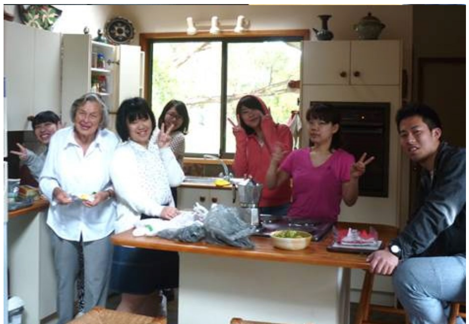
Participants in the "Investigating Diversity, Human Rights and Civil Society in Japan and Australia" Programme in February 2015