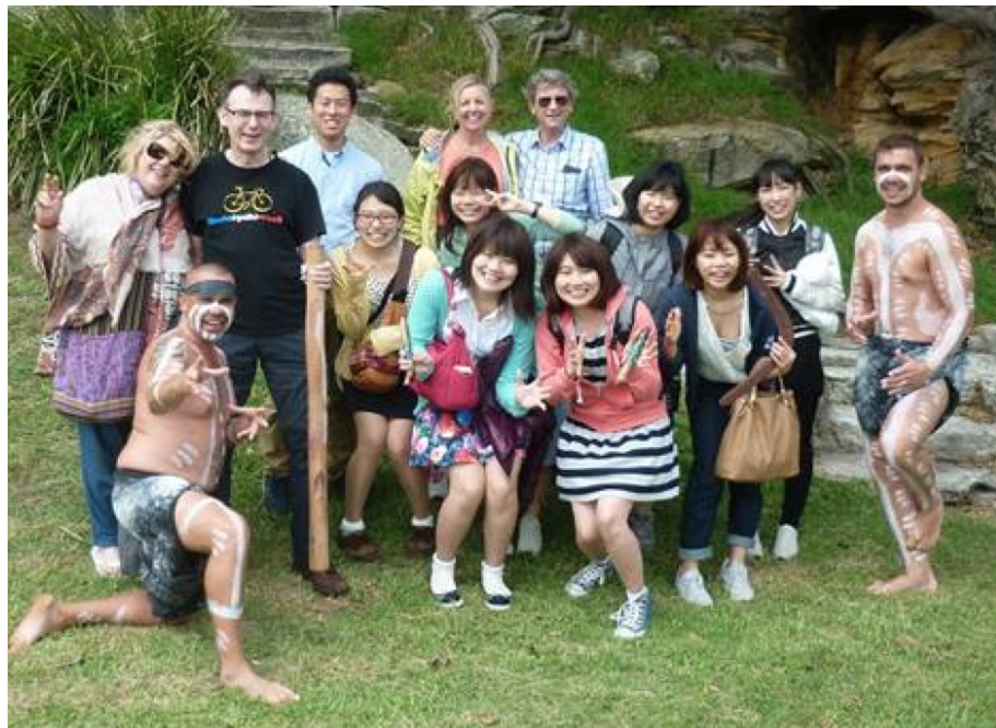
Participants in the "Investigating Diversity, Human Rights and Civil Society in Japan and Australia" Programme in February 2015