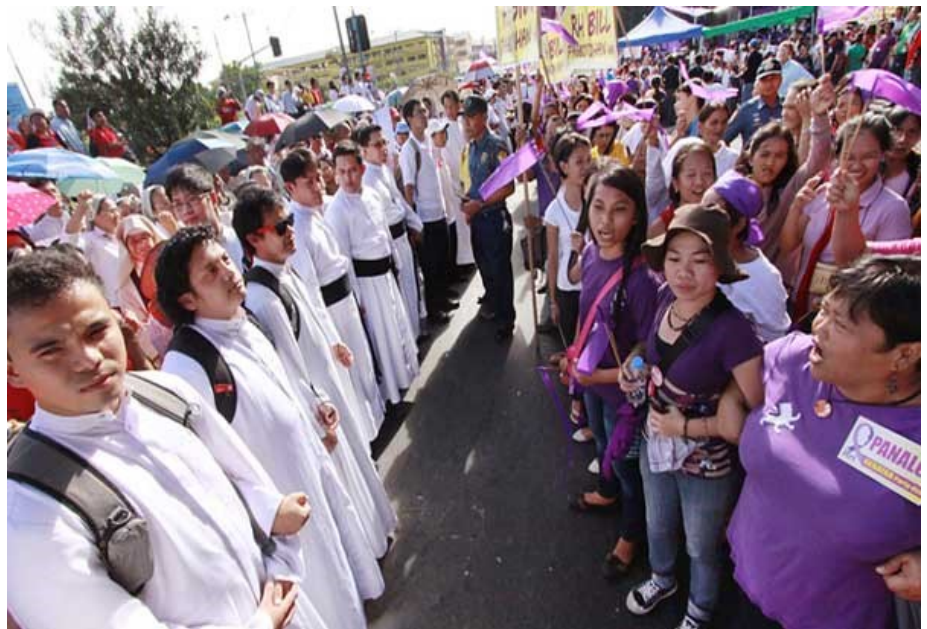
Supporters of the Reproductive Health Bill opposite Priests and members of various religious groups outside the Batasan complex in Quezon City

But was it really worth the extreme reactions? Not really . In the 106-page decision of the Philippine Supreme Court case of Imbong v Ochoa , the RH law was specifically