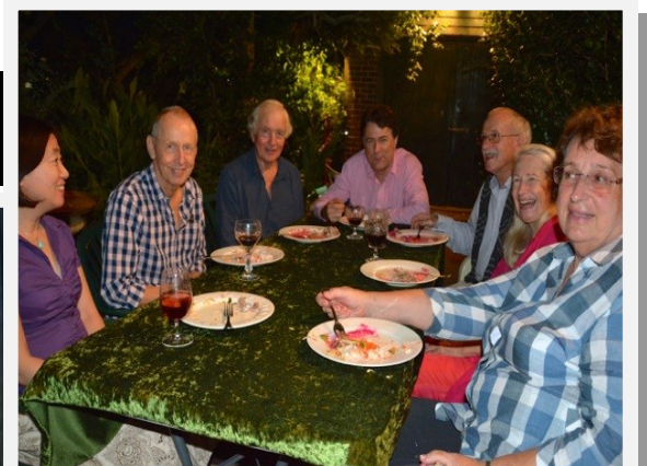
CPACS 25+ celebration dinner