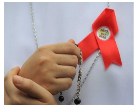
A Catholic nun wearing an anti-Reproductive Health (RH) ribbon

The turning point came when it was finally signed into law in December 2012. Upon the Supreme Court's April 2014 declaration that the RH law was constitutional, the jubilation of women's rights advocates signalled a belief that the battle had finally been won against a hegemonic religious system. The victory was also seen as the state's long-overdue compliance with its obligations under the Convention on the Elimination of All forms of Discrimination Against Women (CEDAW).