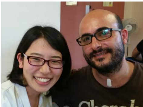
A Japanese student from Chuo University with a participant of the Refugee Language Program

of Tamil asylum seekers was returned to Sri Lanka. They were supposedly screened on board and determined to be non-asylum seekers. Considering that most asylum seekers who arrive by boat take many months, even years, to prove their refugee status to our Immigration Department and law courts, how could anyone judge the status of a person in a few minutes on a boat in the middle of an ocean?